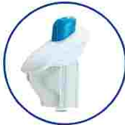
◀ 30 ML TANK CAPACITY