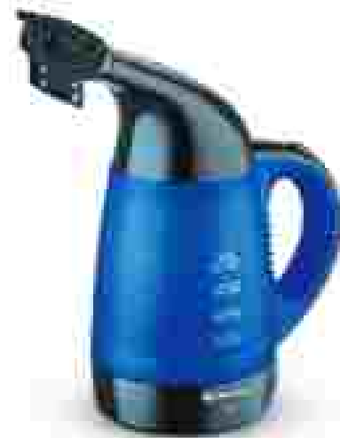
GARMENT STEAMER ATTACHMENT