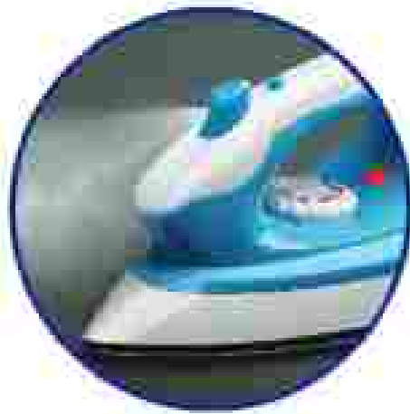
▶ SPRAY NOZZLE